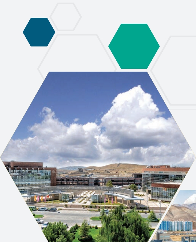
Pardis Technology Park